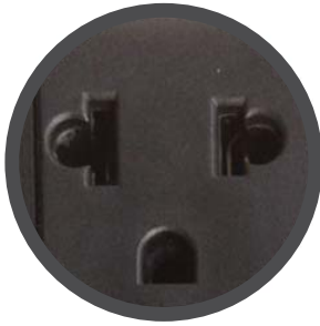
8 Outlets. [4 with AVR Surge protection 4 only with surge protection]

The newest and most advance Automatic Voltage Regulator R2C. Equipped with an exclusive 4 port smart charger for tablets, Smartphone and Bluetooth speakers, makes this series the most complete and advanced one. The Voltage Regulator corrects high and low voltages providing a 220 VCA.