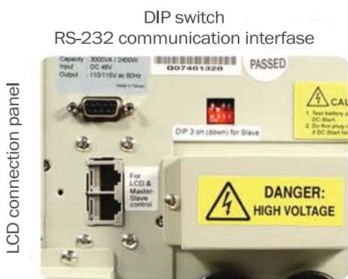
LCD connection panel