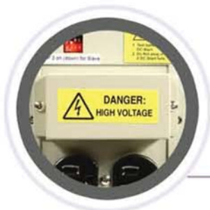
Outputs and AC corner alimantation