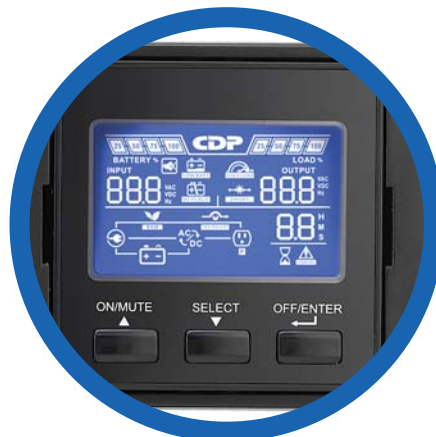
LCD panel with 90° rotation