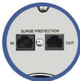
Data line protection